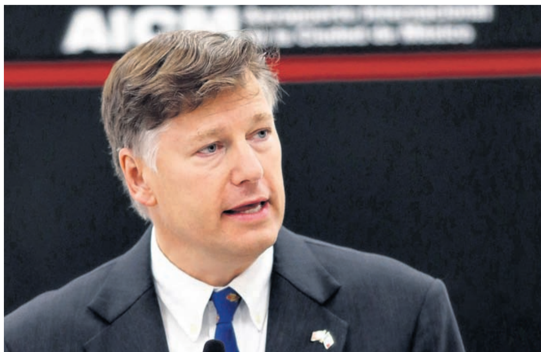
Then U.S. Ambassador to Mexico Christopher Landau delivers a statement to members of the media at the Benito Juarez International Airport, upon his arrival to Mexico City, Aug. 16, 2019.

The visa revocations follow widespread outrage in Mexico over the concert as prosecutors in two states have launched investigations into the projected images, and a larger national reckoning over how to address the rise of a popular musical genre criticized for romanticizing drug cartels. "I'm a firm believer in freedom of expression, but that doesn't mean that expression should be free of consequences," Landau wrote on X. "The last thing we need is a welcome mat for people who extol criminals and terrorists."