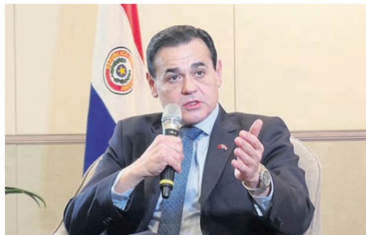
Paraguay Foreign Minister Rubén Ramírez Lezcano speaks during a press conference during his visit in Taipei, Taiwan, Nov. 29, 2024.

"We are under constant attack, and the ministry is taking all necessary steps to defend our confidential information." □