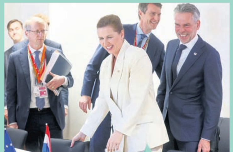
Netherlands' Prime Minister Dick Schoof, right, and Denmark's Prime Minister Mette Frederiksen arrive for a round table meeting at an EU summit in Brussels, Thursday, March 20, 2025.

clearly and calmly show the American president that Greenland is ours." □