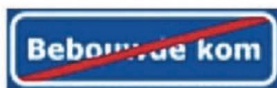
end bebouwde kom