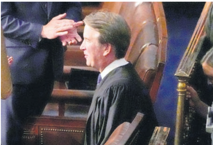
Supreme Court Justice Brett Kavanaugh arrives before President Donald Trump addresses a joint session of Congress at the Capitol in Washington, March 4, 2025.