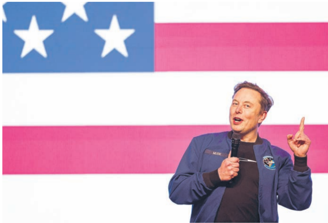
Elon Musk speaks at a town hall Sunday, March 30, 2025, in Green Bay, Wis.

The White House has not disclosed any clear time-