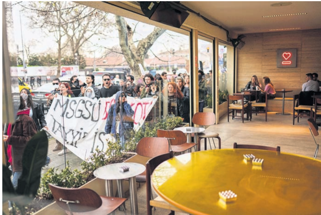
Fine art university students shout slogans as they march past an Espresso Lab coffee bar during a peaceful protest after Istanbul's Mayor Ekrem Imamoglu was arrested and sent to prison, in Istanbul, Turkey, Thursday, March 27, 2025.

Ozel had called for people to shun companies he said supported the government, particularly media