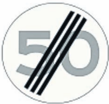
end speed limit