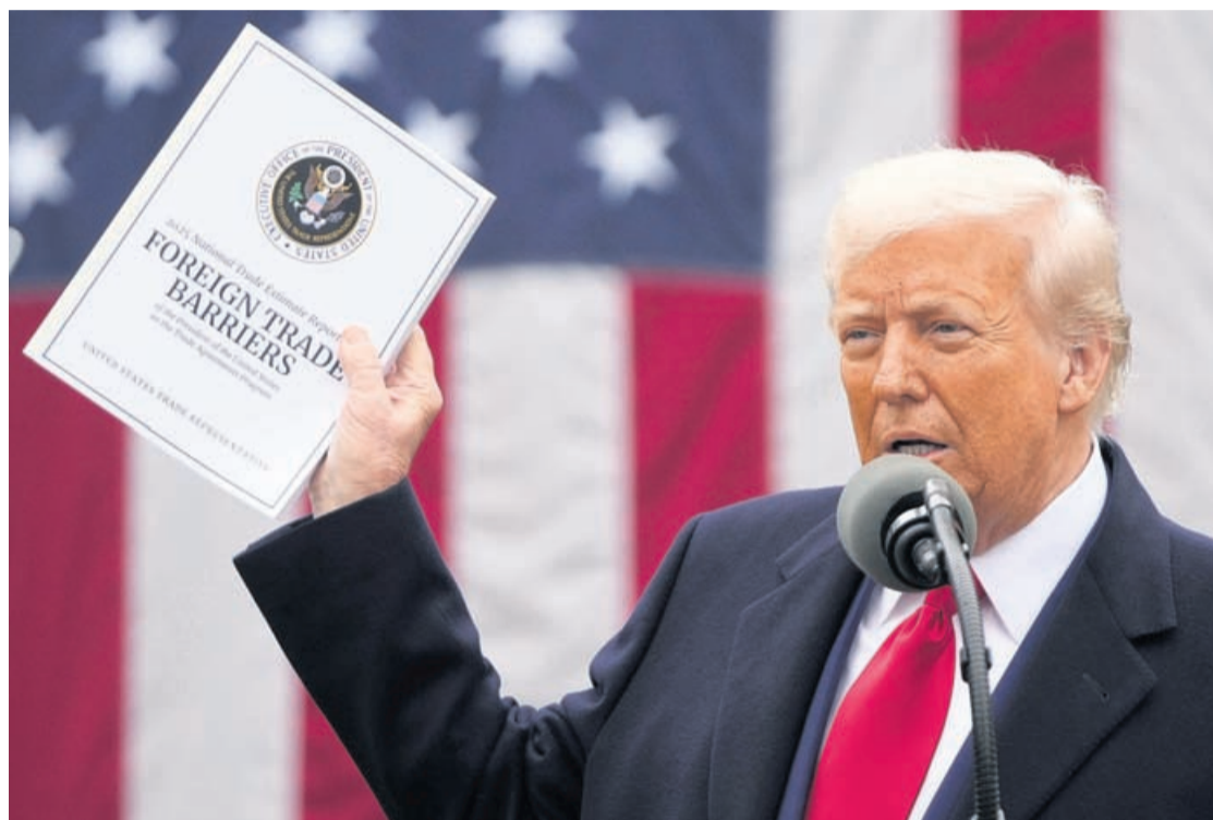
President Donald Trump speaks during an event to announce new tariffs in the Rose Garden at the White House, Wednesday, April 2, 2025, in Washington.

White House trade adviser Peter Navarro has suggested the new tariffs would raise $600 billion an-