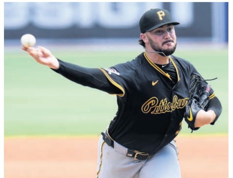
Pittsburgh Pirates pitcher Paul Skenes delivers to the Tampa Bay Rays during the second inning of a baseball game Wednesday, April 2, 2025, in Tampa, Fla.

The Tampa Bay Rays head to Texas with Zack Littell set to face RHP Tyler Mahle. □