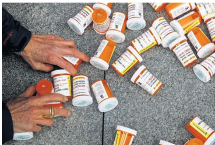
A protester gathers containers that look like OxyContin bottles at an anti-opioid demonstration in front of the U.S. Department of Health and Human Services headquarters in Washington on April 5, 2019.