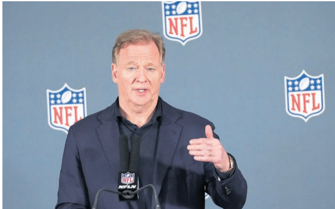
NFL Commissioner Roger Goodell speaks during a news conference at the NFL football annual meetings Tuesday, April 1, 2025, in Palm Beach, Fla.

The league was mostly pleased with the experimental kickoff put in place for 2024 that led to the rate of kickoff returns increasing from a record-low 21.8% in 2023 to 32.8% last season, while reducing the rate of injuries on what had been the game's most dangerous play. The rule made kickoffs more like scrimmage plays by placing the cover-