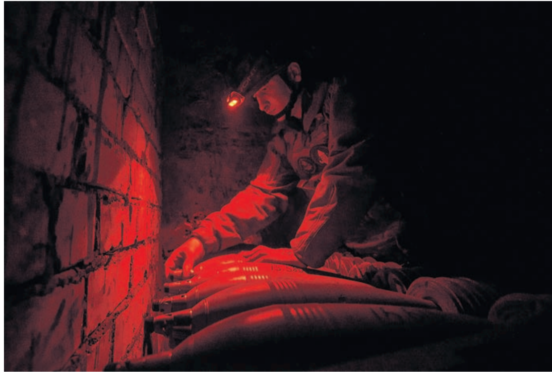
A Ukrainian serviceman of the Bugskiy Gard unit prepares a 120mm mortar before firing towards Russian positions on the front line, in the Kherson region, Ukraine, Sunday, Nov. 3, 2024.