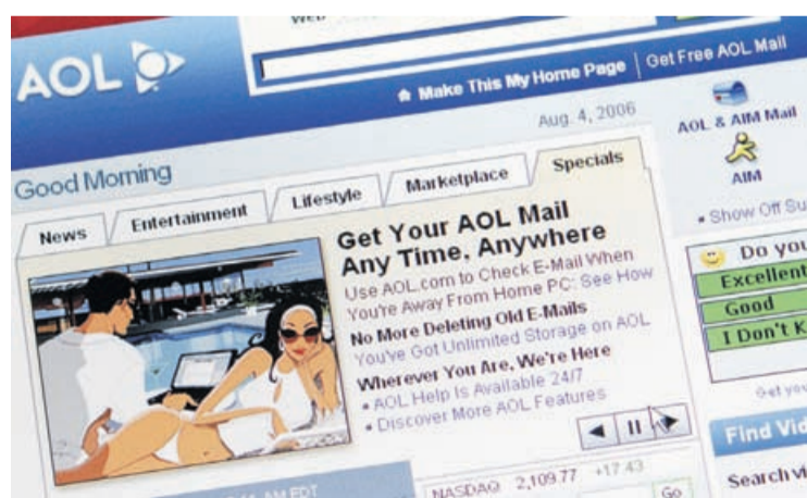
An election worker processes mail-in ballots for the 2024 General Election at the Philadelphia Election Warehouse, Tuesday, Nov. 5, 2024, in Philadelphia.

Iranian operatives also conducted a hack-and-leak operation of emails belonging to Trump campaign associates in what officials have assessed was an effort to interfere in the presidential election. □