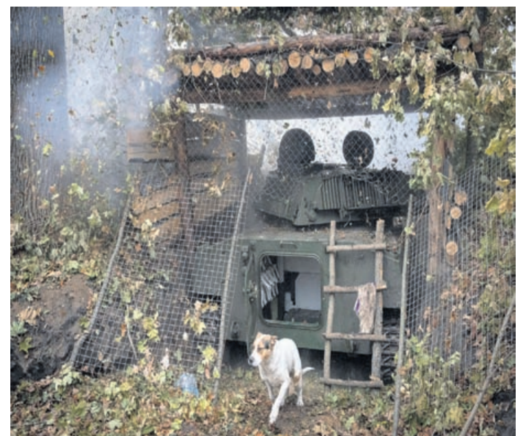
A dog reacts as self-propelled artillery howitzer "Gvozdika" fires towards Russian positions on the frontline in the Kharkiv region, Ukraine, Thursday, Nov. 7, 2024.

The decision expands the footprint of U.S. government contractors working in Ukraine. The State Department already has contracted with U.S. companies to work inside the country, including on the energy grid. In addition, a number of American companies have workers in Ukraine under contracts