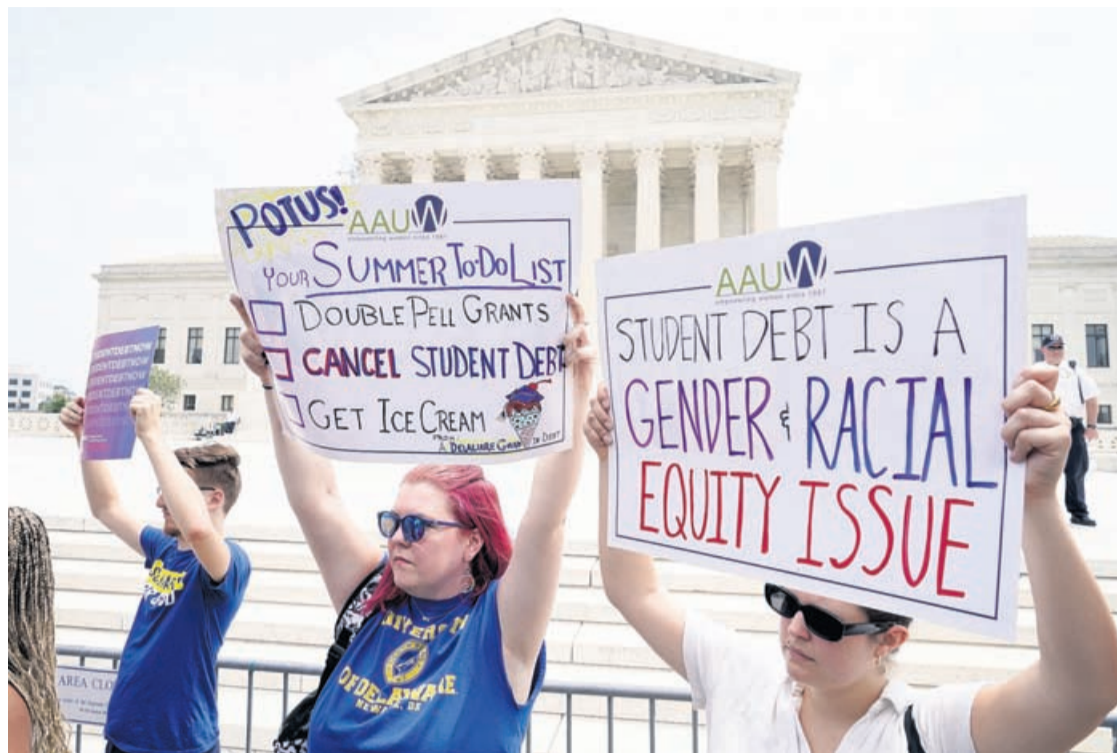
People demonstrate outside the Supreme Court, June 30, 2023, in Washington.

President-elect Donald Trump and his fellow Republicans have criticized Biden's loan forgiveness efforts, and lawsuits by GOP-led states have held up plans for widespread debt cancellation. Trump has not said what he would do on loan forgiveness, leaving millions of borrowers facing uncertainty over their personal finances.