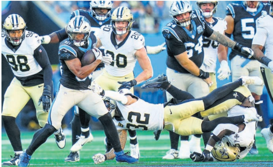
Carolina Panthers running back Chuba Hubbard is tackled by New Orleans Saints safety Tyrann Mathieu during the second half of an NFL football game Sunday, Nov. 3, 2024, in Charlotte, N.C.