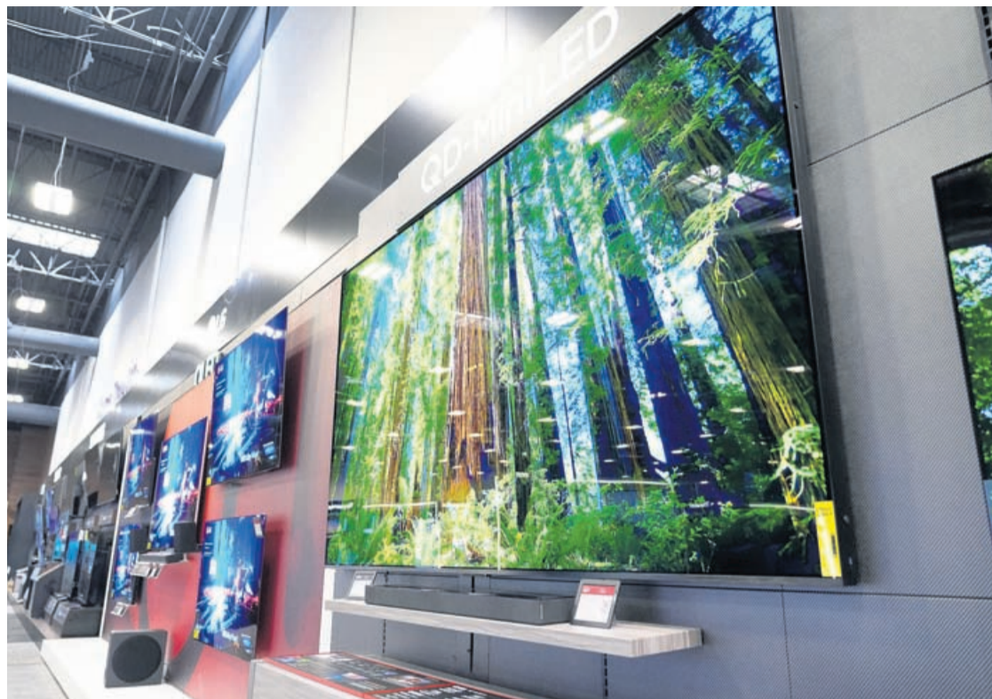
A 115-inch TCL television, right, is displayed at a Best Buy store in Dallas, Friday, Oct. 25, 2024.