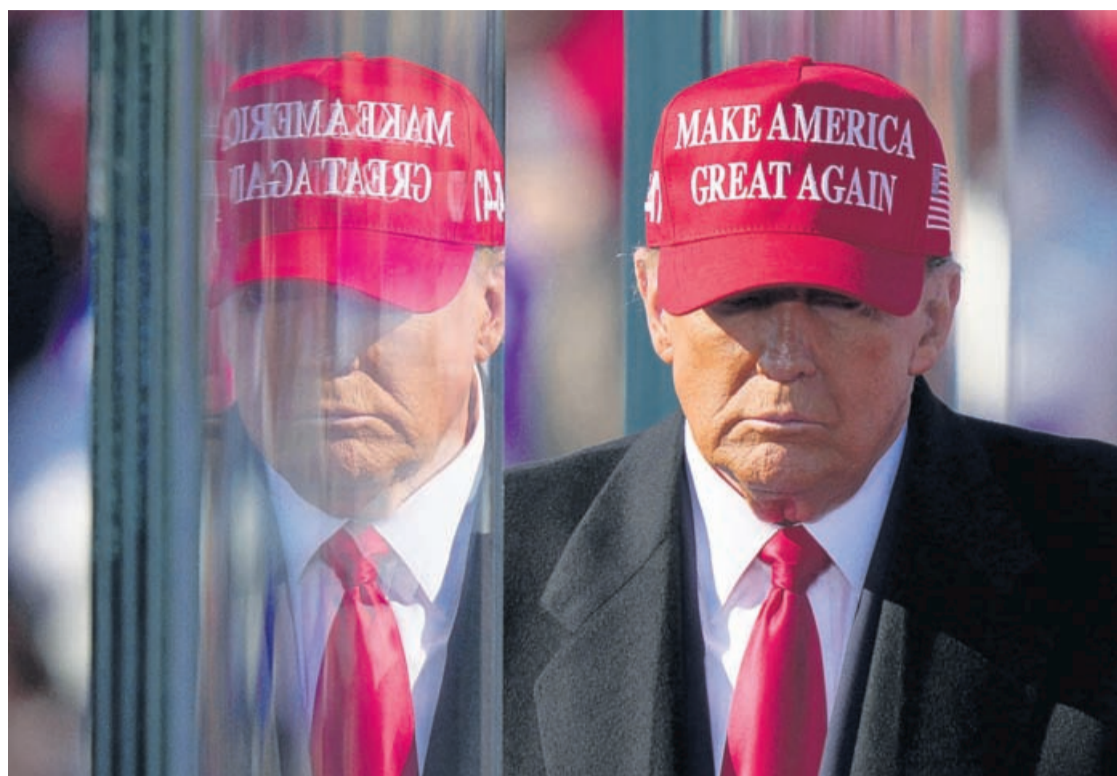
Republican presidential nominee former President Donald Trump is reflected in the bullet proof glass as he finishes speaking at a campaign rally in Lititz, Pa., Nov. 3, 2024.