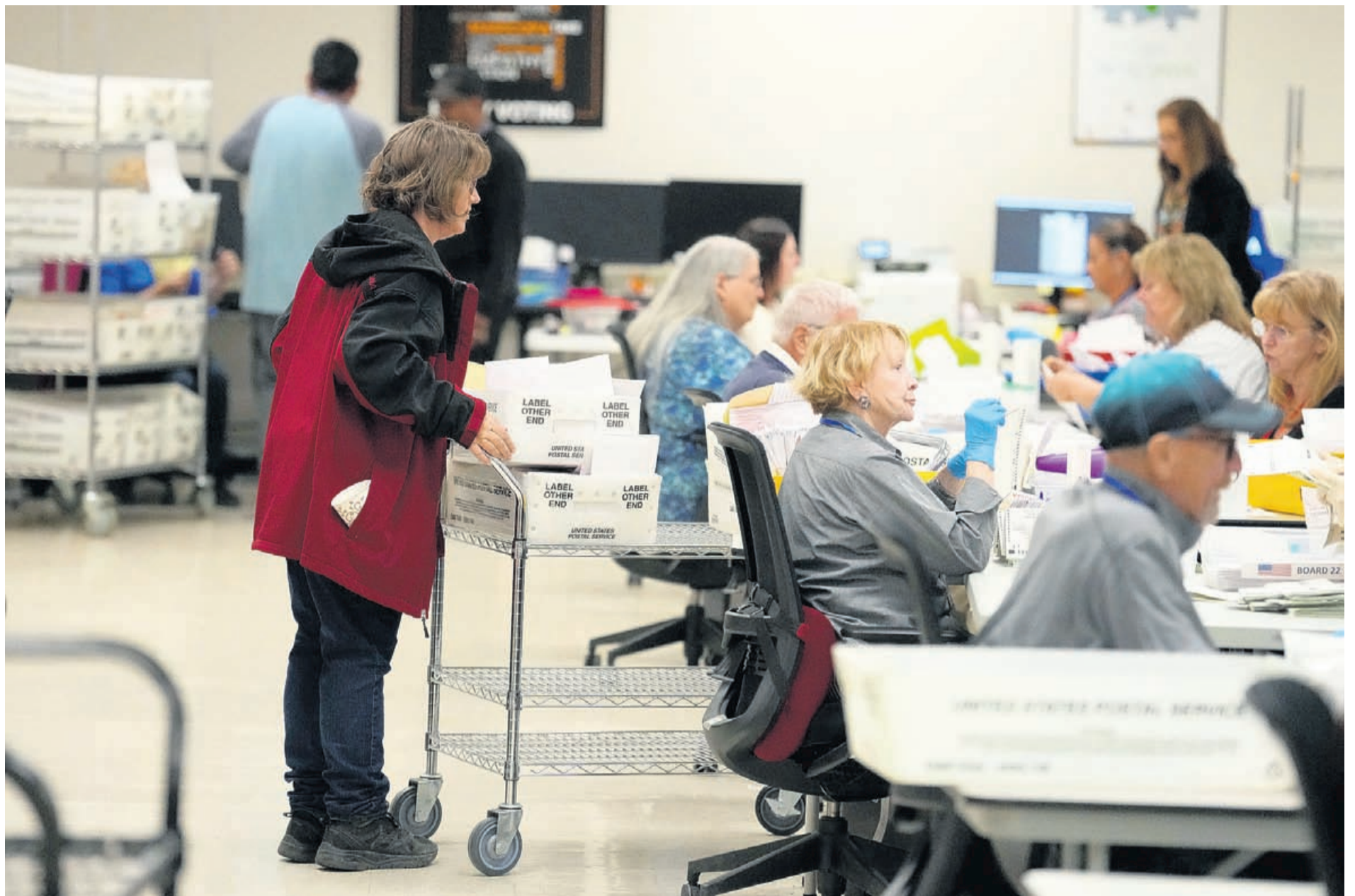
Election workers process ballots at the Maricopa County Tabulation Center Wednesday, Nov. 6, 2024, in Phoenix.