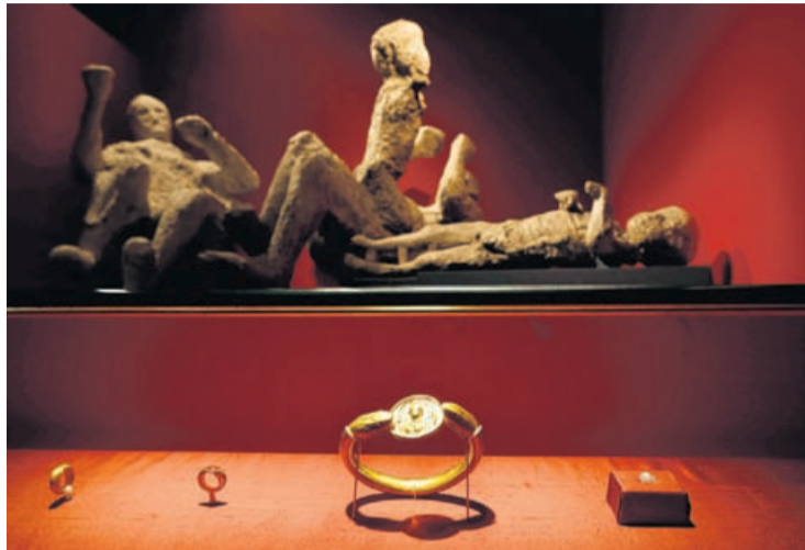
Jewelry found in the ruins of a house in Pompeii are displayed, backdropped by the casts of two adults and two children who died together in the house in Pompeii, at the exhibition, "Life and death Pompeii and Herculaneum," at the British Museum in central London, March 26, 2013.