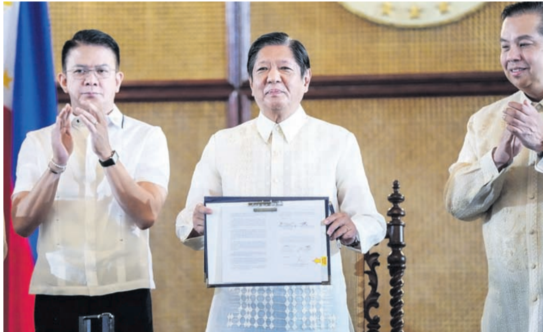
In this photo provided by the Malacanang Presidential Communications Office, Philippine President Ferdinand Marcos Jr., center, holds a document beside Senate President Francis Escudero, left, and House Speaker Martin Romualdez, right, during the ceremonial signing of the Philippine Maritime Zones and Philippine Archipelagic Sea Lanes Act, at the Malacanang presidential palace, in Manila, Philippines, Friday, Nov. 8, 2024.

pine Maritime Zones act and the Philippine Archipelagic Sea Lanes act, were signed by Marcos in a nationally televised ceremony attended by top military and national security officials. They further cement