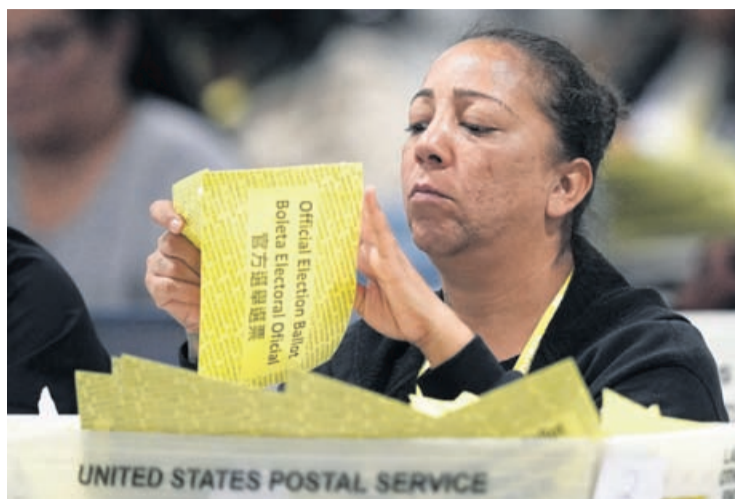
An election worker processes mail-in ballots for the 2024 General Election at the Philadelphia Election Warehouse, Tuesday, Nov. 5, 2024, in Philadelphia.

Interference from Russia and other foreign adversaries was a constant theme running through election season.