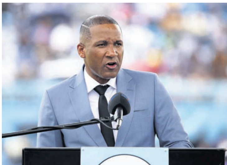
Botswana's new president Duma Boko addresses crowds at his inauguration ceremony in Gaborone, Botswana, Friday, Nov. 8, 2024.