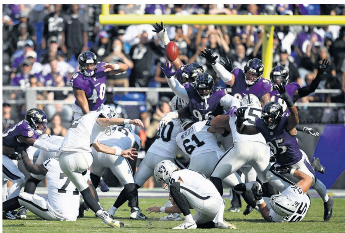
Las Vegas Raiders place kicker Daniel Carlson (2) kicks a field goal against the Baltimore Ravens during the second half of an NFL football game, Sunday, Sept. 15, 2024, in Baltimore.

The Raiders quickly got the ball back and Minshew moved Las Vegas downfield before Carlson kicked his fourth field goal of the game.