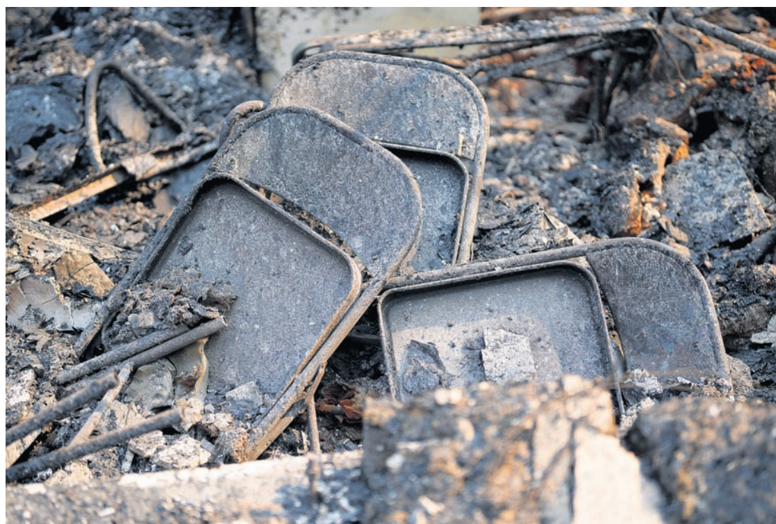
Chairs are stacked among the ruins in the aftermath of the Bridge Fire, Thursday, Sept. 12, 2024, in Wrightwood, Calif.