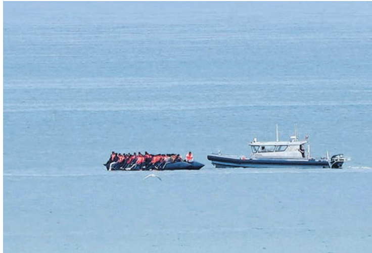
A boat thought to be with migrants is escorted by a vessel from the French Gendarmerie Nationale off the Wimereux beach, France, Sept. 4, 2024.

Six people were taken to hospital "in relative