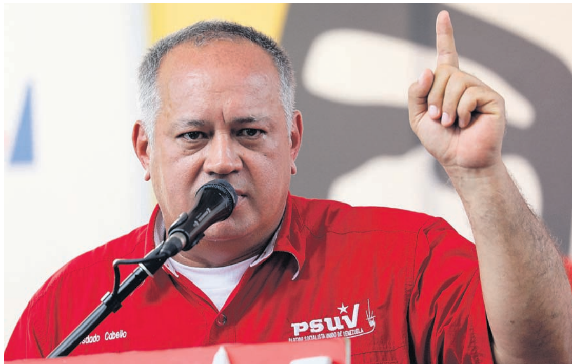
Socialist Party President Diosdado Cabello gives his weekly press conference, in Catia La Mar, La Guaira, Venezuela, Aug. 19, 2019.