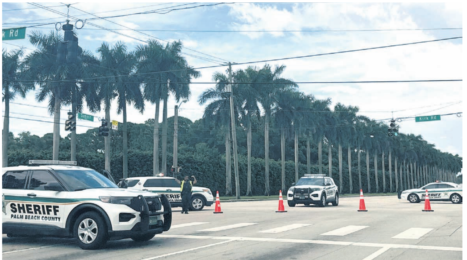
Sheriff vehicles are pictured near Trump International Golf Club, Sunday, Sept. 15, 2024, in West Palm Beach, Fla., after gunshots were reported in the vicinity of Republican presidential candidate former President Donald Trump.

Trump's running mate, Ohio Sen. JD Vance, said in a post online: "I'm glad President Trump is safe. I spoke to him before the news was public and he was, amazingly, in good