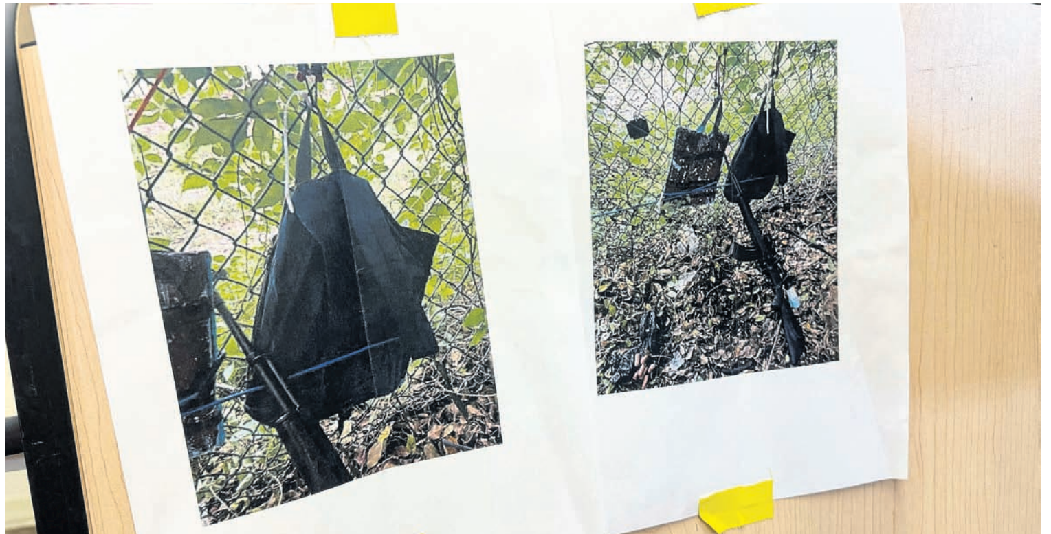
Photos that show an AK-47 rifle, a backpack and a Go-Pro camera on a fence outside Trump International Golf Club taken after an apparent assassination attempt of Republican presidential candidate former President Donald Trump, are displayed during a news conference at the Palm Beach County Main Library, Sunday, Sept. 15, 2024, in West Palm Beach, Fla.

U.S. Secret Service agents posted a few holes up from where Trump was playing noticed the muzzle of an AK-style rifle sticking through the shrubbery that lines the course, roughly 400 yards away.