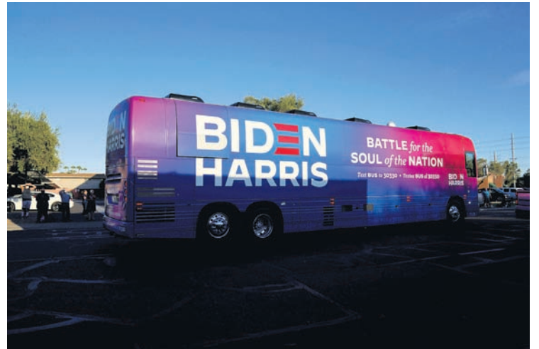
Democratic presidential candidate former Vice President Joe Biden and Democratic vice presidential candidate Sen. Kamala Harris, D-Calif., ride on a bus in Phoenix, Oct. 8, 2020, on a small business bus tour.

against the Democrats on the bus and that their actions are protected speech. Here's what else to know: What happened on Oct. 30, 2020? Dozens of cars and trucks organized by a local Trump Train group swarmed the bus on its way from San Antonio to Austin. It was the last day of early voting in Texas for the 2020 general