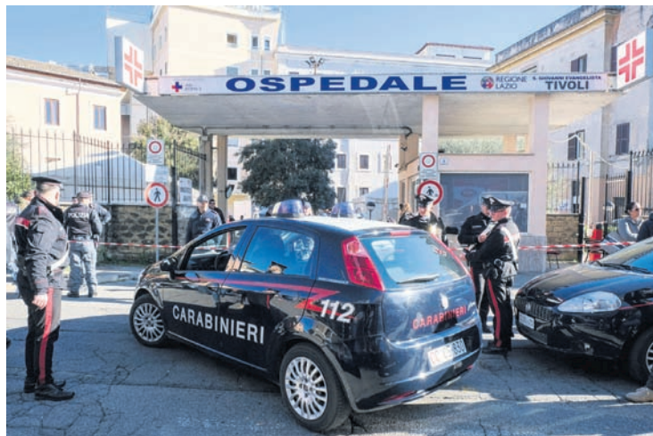
Carabinieri (Italian paramilitary police) officers outside the San Giovanni Evangelista Hospital in Tivoli, Italy, on Dec. 9, 2023.

With over 16,000 reported cases of physical and verbal assaults nationwide in 2023 alone, Italian doctors and nurses have called for drastic measures.