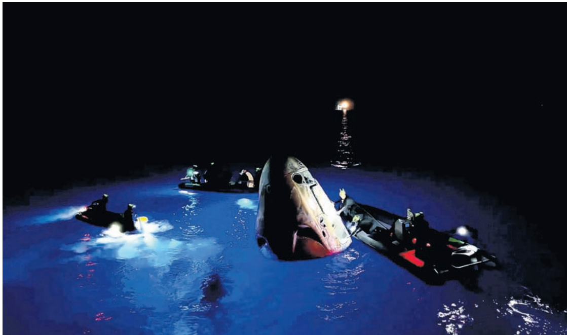
This image made from SpaceX video shows its capsule, center, carrying tech entrepreneur Jared Isaacman with his crew after it reached the Gulf of Mexico near Florida's Dry Tortugas early Sunday, Sept. 15, 2024.