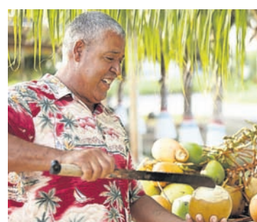
its Dutch counterpart, the "bitterbal".

ORANJESTAD — Want to taste something different for a change? How about some Aruban snacks that you can find all around the island? Hop in your car, and go to these locations to find some of the most popular and tasty snacks that are beloved by our locals.