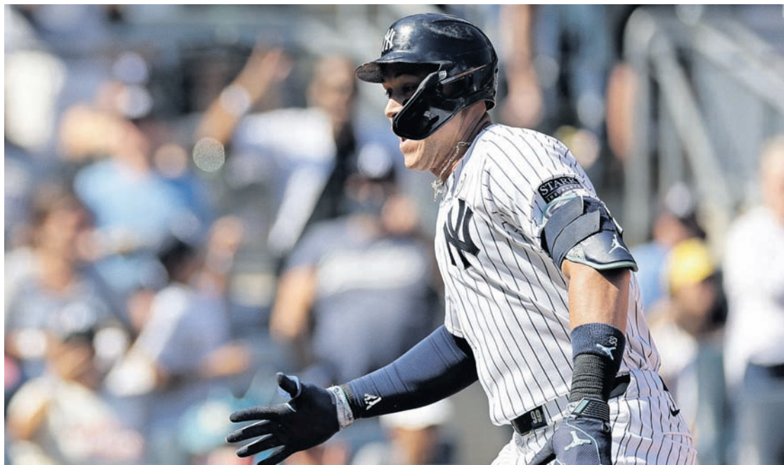
New York Yankees' Aaron Judge reacts after hitting a two-run home run during the third inning of a baseball game against the Boston Red Sox, Sunday, Sept. 15, 2024, in New York.

Judge joined Babe Ruth (1921, 1927), Roger Maris (1961), Mickey Mantle (1961) as Yankees with at least 53 homers through New York's first 150 games. "It's been an amazing sea-